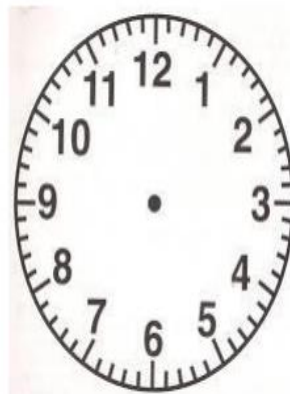
The teams are on the field- 7.30pm (7.33pm)