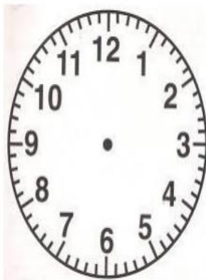
Buy a programme @ 7.20pm (7.18pm 4 th Class)